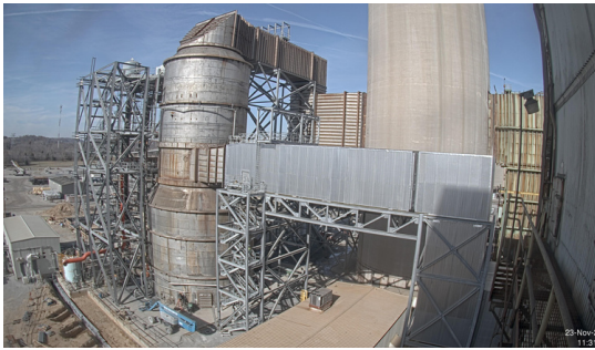
WILSON STATION SCRUBBER SYSTEM TO REDUCE EMISSIONS AND LOWER GENERATING COSTS

Coal-fired Wilson Station excels at efficiency and reliability, providing a steady source of 24-hour generation crucial for the grid and our Member-Owners. Big Rivers recently invested more than $100 million to replace Wilson Station's existing Kellogg Wet Flue-Gas Desulfurization system consisting of four horizontal modules with a Since Vertical Tower Absorber that will reduce emissions even further and lower generating costs. Additionally, the new FGD system will produce synthetic gypsum for wallboard production, thus eliminating the need to landfill the FGD byproduct. Beneficial reuse of the byproduct continues with the sale of the ash product to cement and concrete production facilities. Moving forward, little to no product will be placed in the onsite landfill.