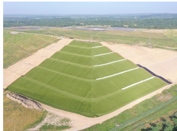
WILSON STATION LANDFILL WITH GEO-SYNTHETIC MEMBRANE COVERED WITH TURF