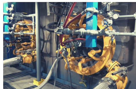
SEBREE STATION CONVERTED FROM COAL TO NATURAL GAS IN EARLY 2022.

Additionally, Big Rivers recently spent more than $40 million to convert its Sebree Station from coal to natural gas, cutting the plant's emissions by more than 50% and further diversifying generation fuel supply needs. By balancing the overall fuel load between gas and coal, Big Rivers helps protect both against price volatility and supply constraints, and we simultaneously solidify our ability to meet the energy demands of our Member-Owners in all situations.