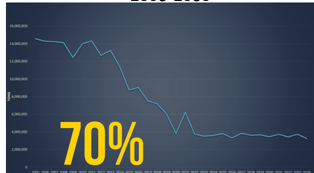
CARBON REDUCTION 2005-2030

BIG RIVERS HAS CUT CARBON EMISSIONS BY MORE THAN 70% SINCE 2005.