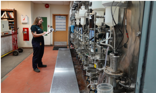
THE BIG RIVERS LABORATORY AT WILSON STATION

Big Rivers utilizes onsite laboratory facilities, including a state-certified central laboratory staffed with full-time scientists using state-of-the-art equipment, to conduct ongoing monitoring to ensure its water quality and compliance with environmental regulations.